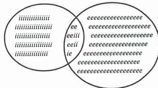
Fig 1. Communication dialogue

The exchange of ideas takes place when two or more people get involved in the communication dialogue as illustrated in figure 1.