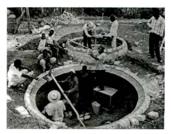
Fig. 1b: Fixed-half-dome digester design